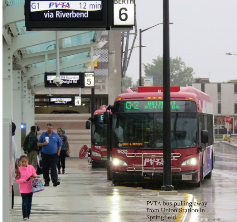
PVRTA bus pulling away from Union Station in Springfield.