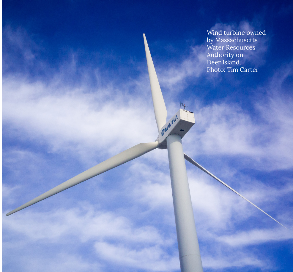
Wind turbine owned by Massachusetts Water Resources Authority on Deer Island.

Visit our website or email us at info@cabaus.org for more information