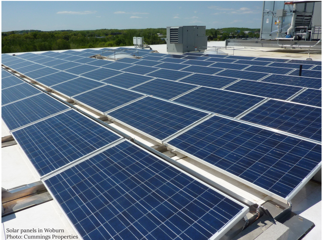
Solar panels in Woburn