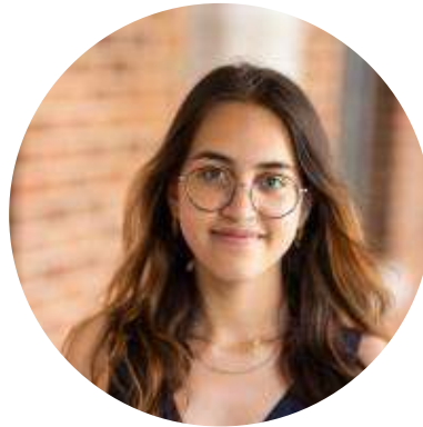
Student Fellow, Change the Chamber