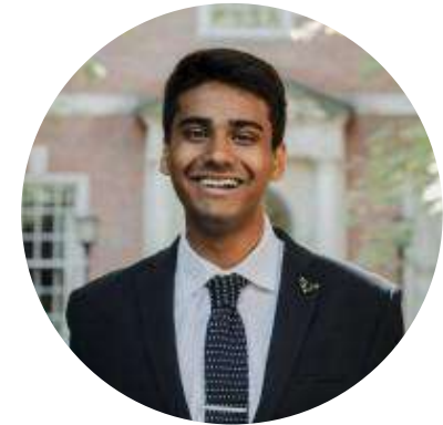
Executive Director, TREEage