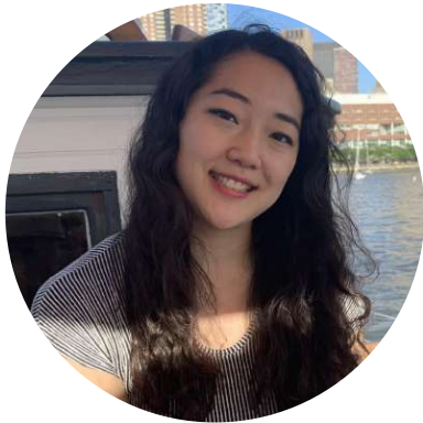
Policy Analyst, Zero Hour