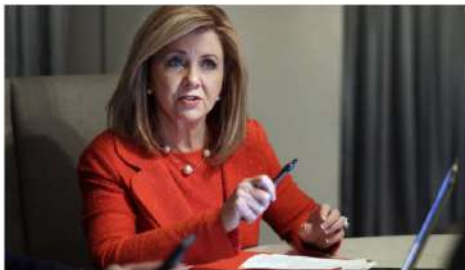
Marsha Blackburn (R-TN) - $1,000,000

Accounting only for their public donations, the Chamber has spent millions each year on electing climate-deniers to Congress that stall state-level improvements.