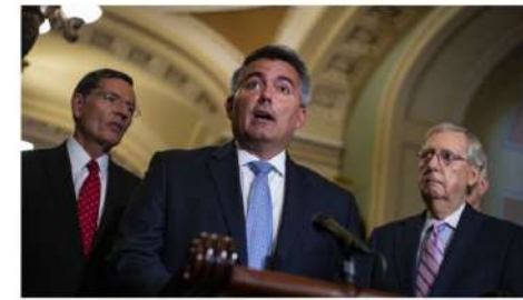
Cory Gardner (R-CO) - $1,600,000