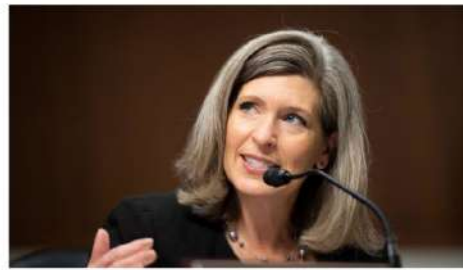
Joni Ernst (R-IA) - $1,915,580